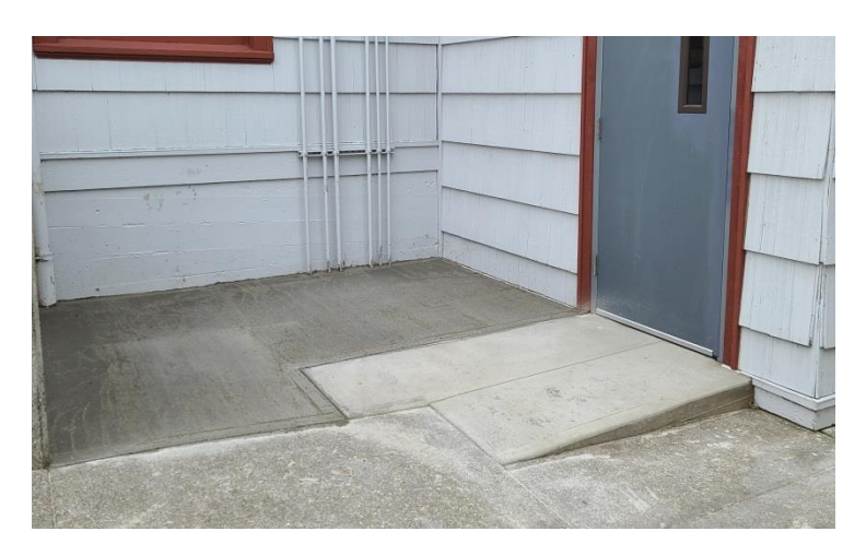
Wheelchair Landing at TMS Gym

Wheelchair landing at the new emergency door is poured and cured; this update will make our gym a safer place for our kids and the community.